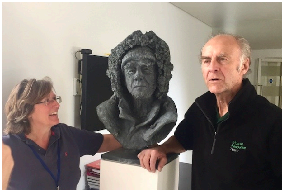
Sir Ranulph Fiennes and his image which now resides at the Royal Geographical Society